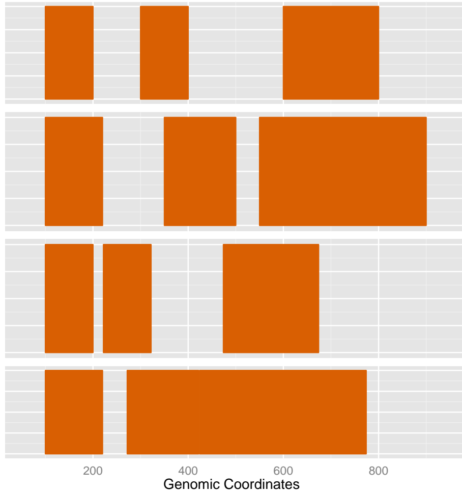
Figure 6: shrinkageFun demonstration for multiple GRanges, the top two tracks are the original tracks, please note how we clipped common gaps for those two tracks and shown as bottom two tracks.