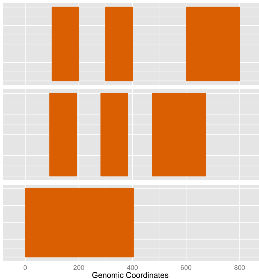
Figure 5: Shrink single GRanges. The first track is original GRanges, the second one use a ratio which shrink the GRanges a little bit, and default is to remove all gaps shown as the third track