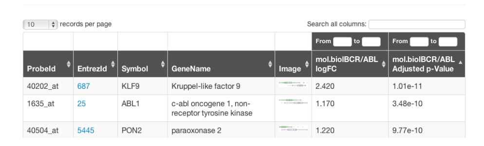
Figure 5: Resulting page created for analysis of a microarray study with limma.