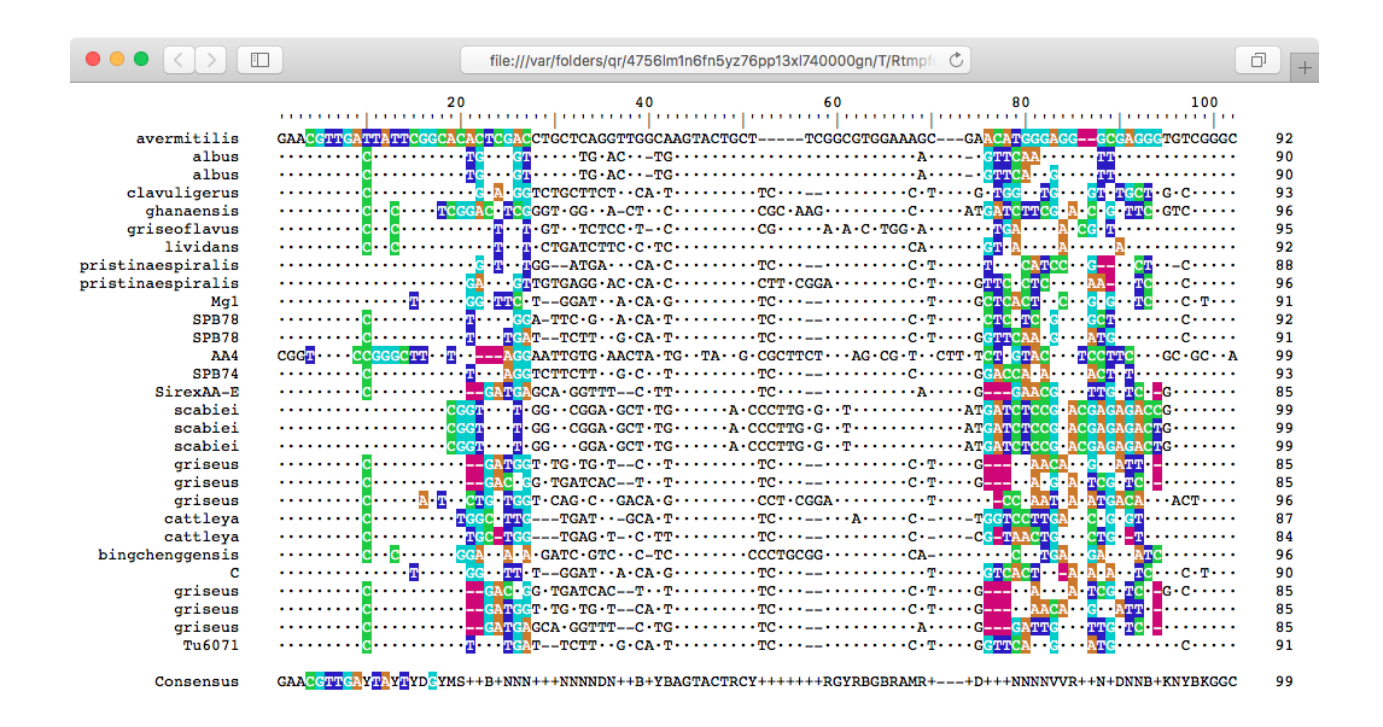
Figure 2: Amplicon with the target site for each primer colored

> BrowseSeqs(amplicon, colorPatterns=c(4, 27, 76, 94), highlight=1)