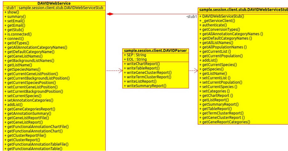
Figure 1: R-to-Java class diagram. RDAVIDWebService uses rJava to access/control DAVID web service through RDAVIDWebServiceStub and parse the reports back to R by DAVIDParser . Note that operation signatures have been omitted for simplicity.

The package implements RDAVIDWebService , a reference class object by means of R5 paradigm, for DWS communication through a Java client ( RDAVIDWebServiceStub ). This allows the establishment of a unique user access point (see Figure ??).