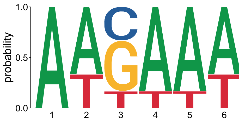
Figure 1: Sequence logo of a Position Probability Matrix

consider the table 3 motif. This matrix can be represented as a probability sequence logo as seen in figure 1.