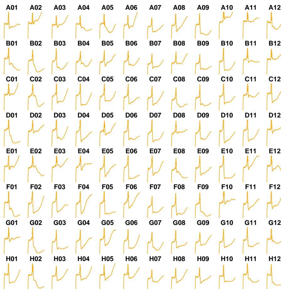
Figure 3: Plate view of a 96-well E-plate from a RTCA assay run.