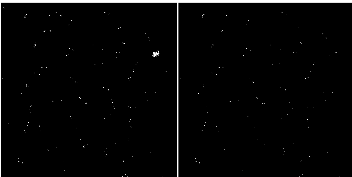
Figure 3. The original input image is given on the left side. Applying analyseParticles with MinSize=5 and MaxSize=20 results in the image shown on the right side. Components smaller than 5 pixels and larger than 20 pixels have been removed.