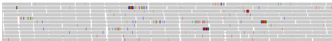
Figure 3: Simulated reads mapped in proper pair

The different read colors indicate the different chromosomes that their mate reads mapped to.