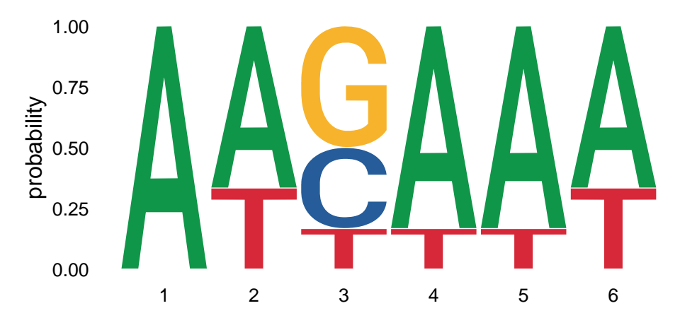
Figure 1: Sequence logo of a Position Probability Matrix