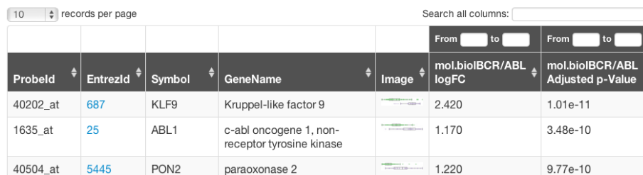
Figure 5: Resulting page created for analysis of a microarray study with limma .