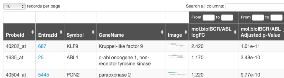
Figure 5: Resulting page created for analysis of a microarray study with limma .