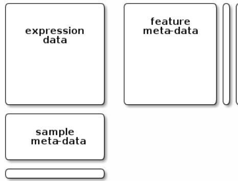
Figure 3: Dimension requirements for the respective expression, feature and sample meta-data slots.

create the expression data, while the others are used as feature meta-data. ecol can be a character with the respective column labels or a numeric with their indices. In the former case, it is important to make sure that the names match exactly. Special characters like '-' or '(' will be transformed by R into '.' when the csv file is read in. Optionally, one can also specify a column to be used as feature names. Note that these must be unique to guarantee the final object validity.